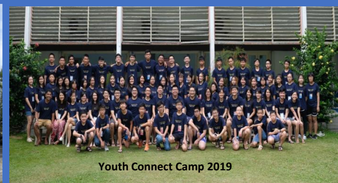
Youth Connect Camp 2019