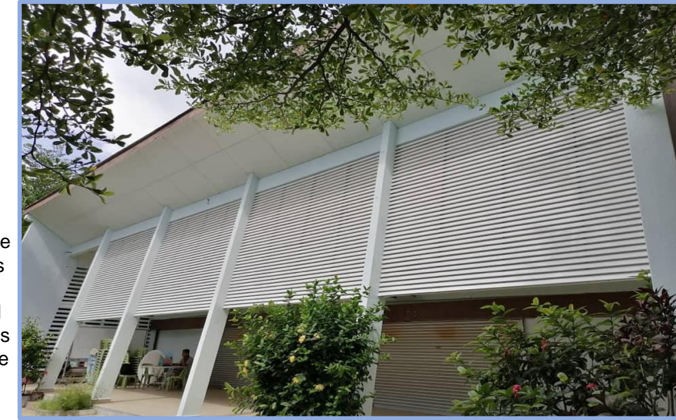
A renewed front of Christian Convention Center which was completed during MCO.